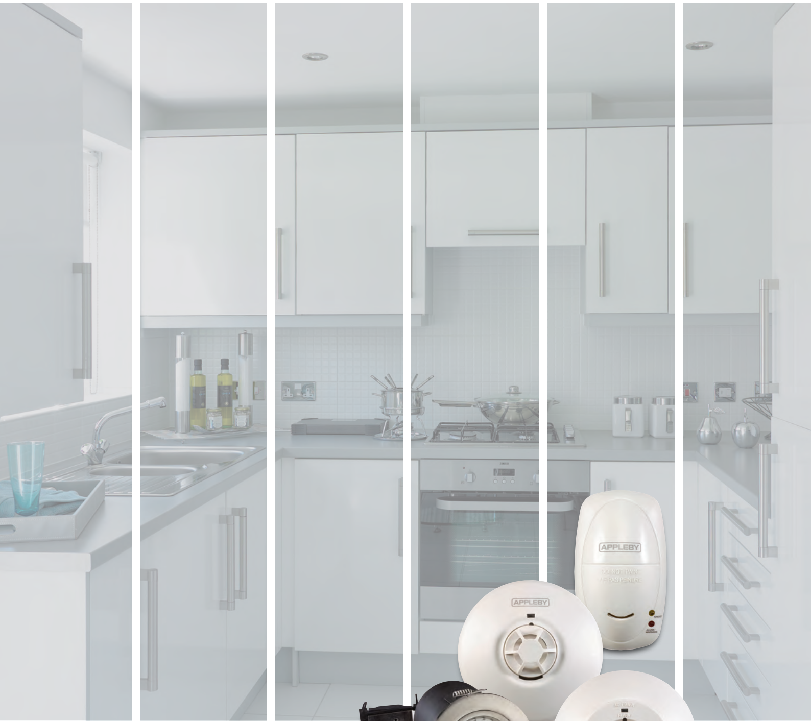
Safety Alarms and Fire Rated Downlighters