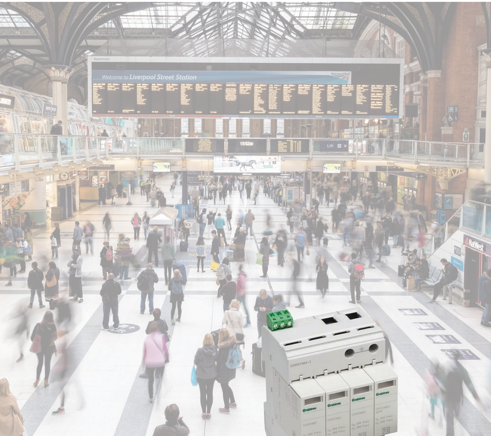
Integral Surge Protection Kits for Type B Distribution Boards